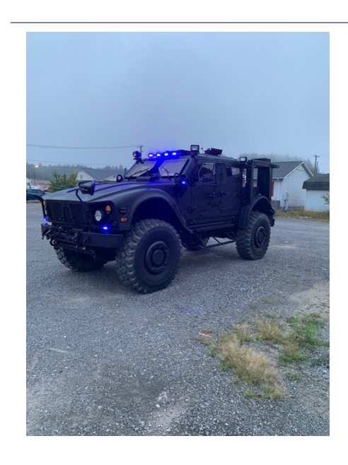
SWAT Armored Vehicle